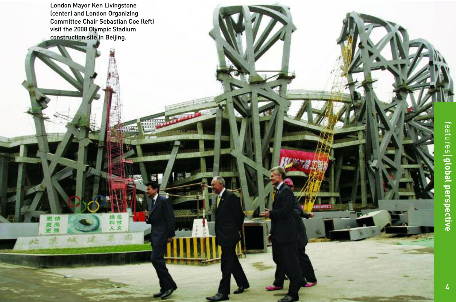
London Mayor Ken Livingstone (center) and London Organizing Committee Chair Sebastian Coe (left) visit the 2008 Olympic Stadium construction site in Beijing.

payoff for East London will be a revitalized neighborhood with 9,000 new, largely low-cost homes; brand-new recreational, cultural, and educational facilities; and an estimated 12,000 new jobs.