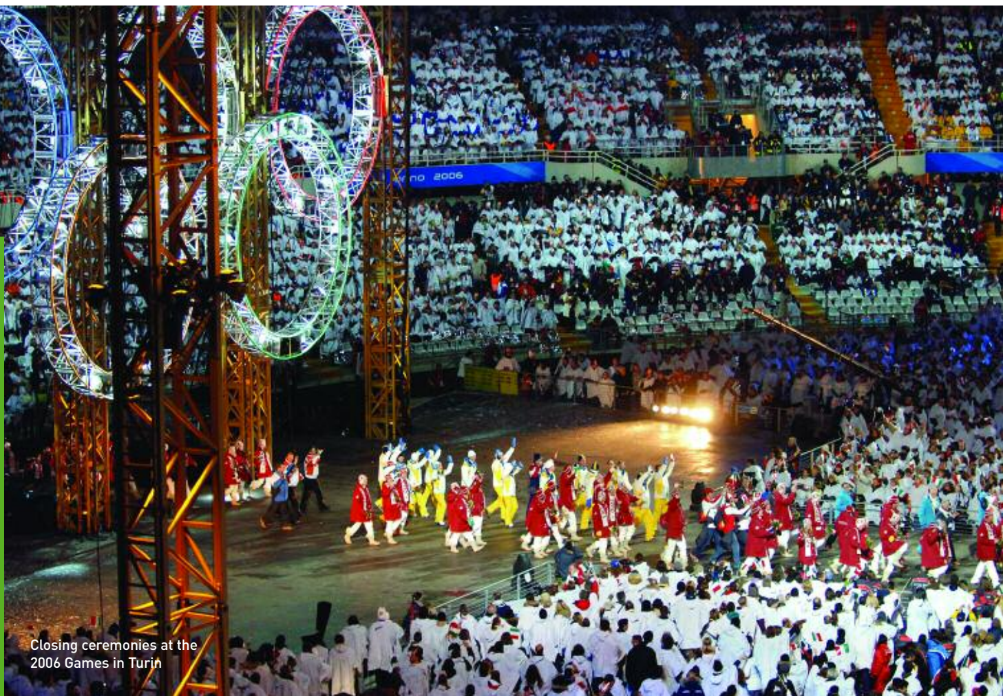
Closing ceremonies at the 2006 Games in Turin

Committee, which operates out of Lausanne, Switzerland, is entirely private, derived mainly from the sale of TV rights and marketing programs.